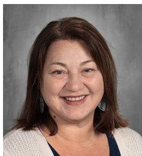
FROM THE ADMINISTRATOR OF CCS

We have had an autumn crammed full-to-bursting with activities at CCS this 2024! We've played volleyball, football, soccer, and run cross country. We've hosted tournaments and meets, prayed at the pole, welcomed our school family at Eaglemania, our grand-friends and veterans on November 11, visited apple orchards and science centers, celebrated the coming of Christmas with The Best Christmas Pageant Ever , and made a joyful noise at choir and band concerts!